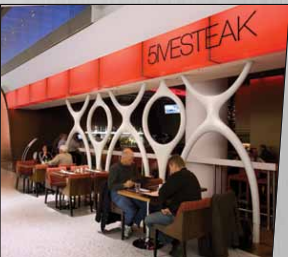
5ive Steak® John F. Kennedy International Airport

Fine Dining Healthcare/Hospitals Schools & Universities Supermarkets Lodging Casinos, Amusement/Leisure Sports Facilities Airport Foodservice