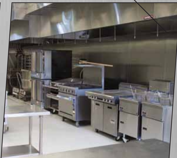
DiBruno Bros. Commissary Philadelphia, PA