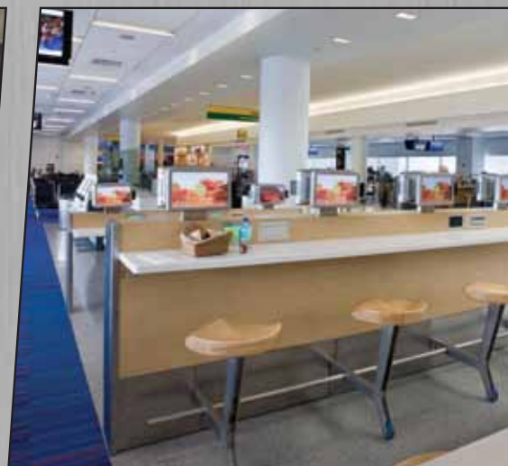
Revive John F. Kennedy International Airport