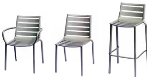
South Beach seating

Powder coated aluminum table and base set Titanium Silver finish