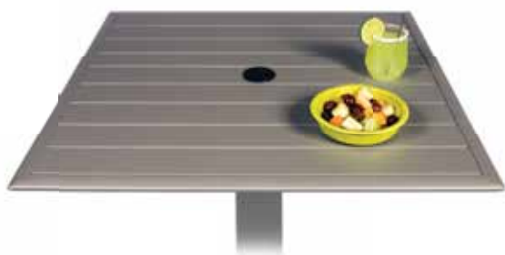
South Beach tables

Powder coated tubular steel, synthetic wicker seating Anthracite finish