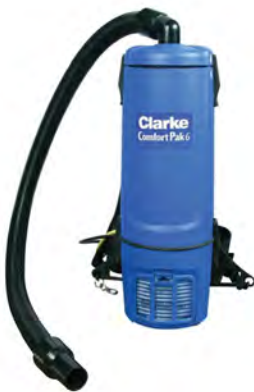
VACUUM CLEANER 6-QUART COMFORT PAK PJP#299023 Packed x Mfg No. 9060610010