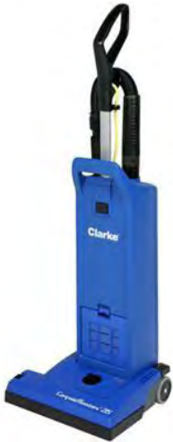
VACUUM CLEANER 12" CARPETMASTER 200 HEPA PJP#299094 Packed 1 Mfg No. 9060208020

Clarke offers a well-rounded line of powerful, reliable vacuums designed for the rigors of commercial use. Heavy-duty motors, intelligent attachments and lightweight construction are the hallmarks of Clarke vacuums. Whether you're looking for a reliable standby or a fleet of versatile and diverse vacuums, Clarke has the product line that can fulfill your needs.