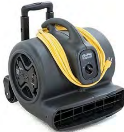
FAN DIRECTAIR PRO AIR MOVER PJP#299020 Packed 1 Mfg No. 98772