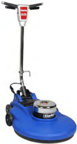
BURNISHER 1500 RPM ULTRA SPEED PRO

Since 1916, Clarke® has manufactured rugged floor maintenance equipment for the commercial, industrial, retail, education, hospitality, and do-it-yourself (DIY) markets. Those products include automatic floor scrubbers, floor polishers, burnishers, sweepers, wood floor sanders, carpet extractors and vacuum cleaners. Clarke is a leader in innovative floor cleaning equipment designs that focus on performance, reliability and ergonomics.