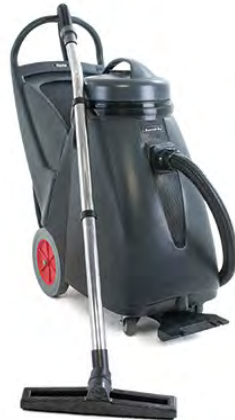
VACUUM WET / DRY 18-GALLON SUMMIT PRO W/ SQUEEGEE