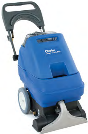
EXTRACTOR CARPET CLEAN TRACK L18