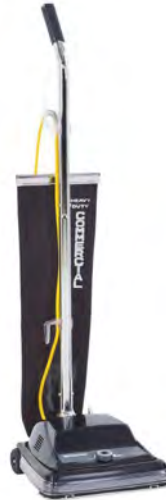
VACUUM CLEANER 12" RELIAVAC PJP#299056 Packed 1 Mfg No. 03002A