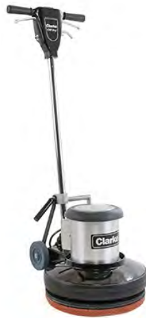
FLOOR MACHINE 20" 1.5HP PRO 20HD

PJP#299077 Packed 1 Mfg No. CLARKE2015HD