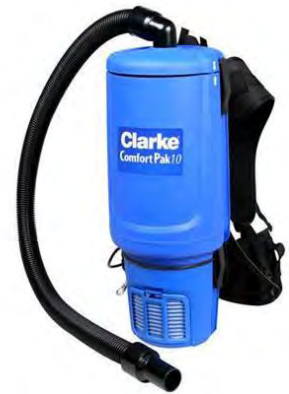
VACUUM CLEANER 10-QUART COMFORT PAK PJP#299073 Packed 1 Mfg No. 9060707010