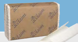
TOWEL C-FOLD ACCLAIM WHITE PJP #166294 Packed 10/240 Mfg No. 20603