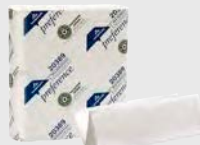
TOWEL MULTI-FOLD PREFERENCE WHITE PJP #166110 Packed 16/250 Mfg No. 20389