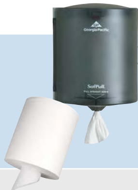
TOWEL CENTER-PULL SOFPULL WHITE PJP #166224 Packed 6/320 Mfg No. 28124