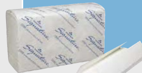
TOWEL C-FOLD SIGNATURE WHITE PJP #166150 Packed 12/120 Mfg No. 23000