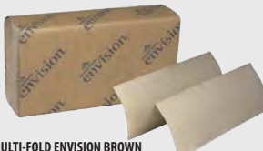
TOWEL MULTI-FOLD ENVISION BROWN PJP #166117 Packed 16/250 Mfg No. 23304