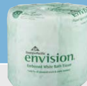
TOILET TISSUE 1PLY ENVISION

PJP #166046 Packed 80/1210 Mfg No. 14580/01