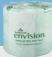
TOILET TISSUE 2PLY ENVISION

PJP #166045 Packed 48/1000 Mfg No. 19448/01