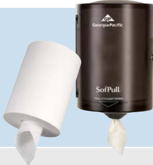
TOWEL CENTER-PULL SOFPULL JR WHITE PJP #166222 Packed 8/275 Mfg No. 28125